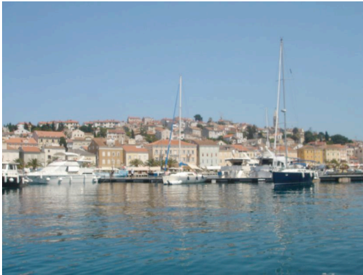
Mali Losinj, a lovely site for diabetes camp

Educational sessions at the camp are different from those organized by AYUDA. They provided informative group sessions for all the campers to participate in at the same time. While these classes are informative, diabetes camps organized by AYUDA differ somewhat. We conduct separate education sessions according to the age of the campers under the theory that older and younger campers learn at different speeds and by different methods and education can be more effective if it is age appropriate.