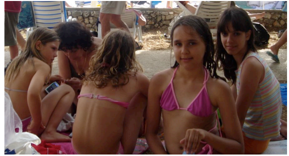
Campers enjoy snack time at camp in Croatia

If you or anyone you know is interested in the Croatia program please don't hesitate to email Raffi Fuchs-Simon at raffifs@ayudainc.net .