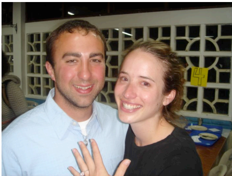
CAE's first marriage proposal